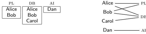
Fig. 1 Left , a bag-of-sets dataset. Right , the same dataset represented as a bipartite graph.

that satisfiability, validity, query containment, and query equivalence are decidable for the former two languages, but not for the latter one.